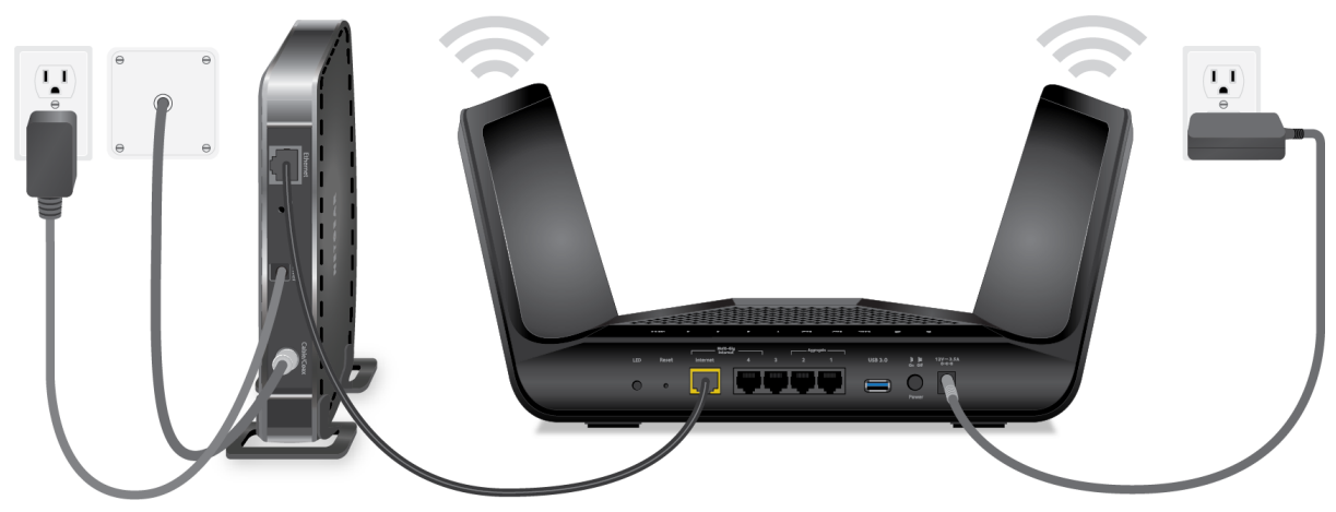
Figure 7. Cable your router

Power on your router and connect it to a modem.