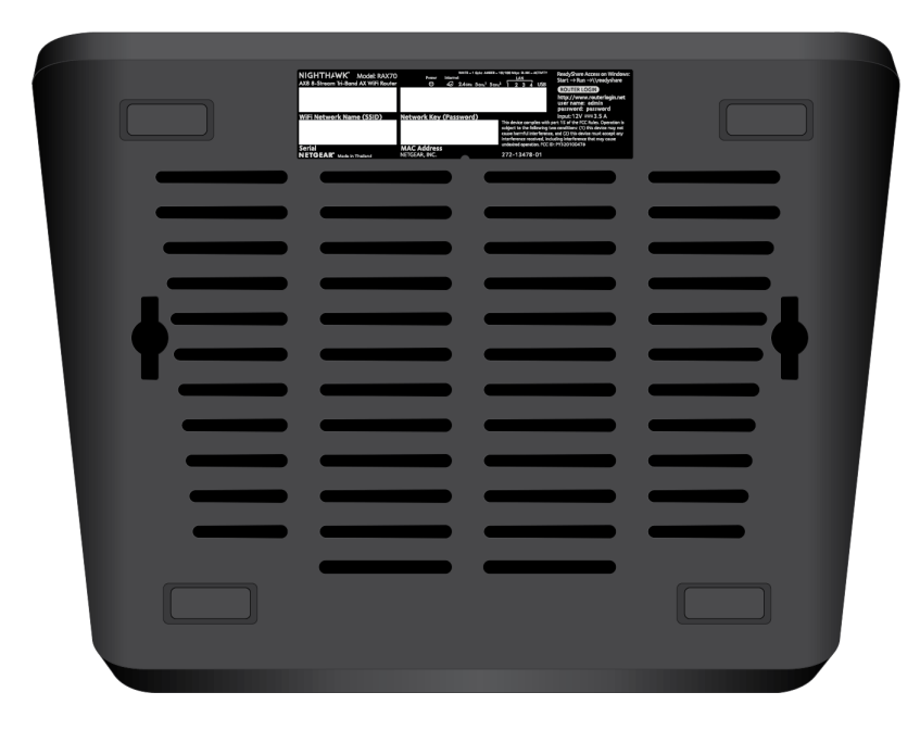
Figure 6. Bottom of the router

Note: We recommend using M3 x 20mm screws appropriately mounted to the wall.