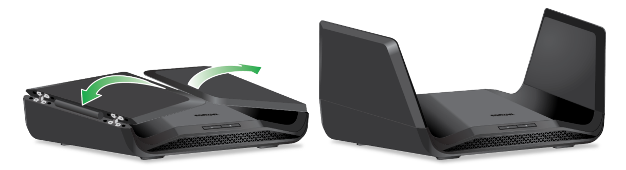
Figure 4. Extend the antennas

Before you install your router, extend the antennas as shown in the following figure.