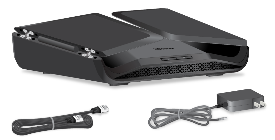
Figure 1. Package contents

Your package contains the router, the power adapter, and an Ethernet cable.