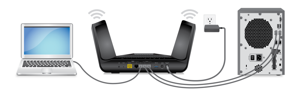
Figure 8. Ethernet port aggregation to a LAN device

WARNING: Do not connect an unmanaged switch to Ethernet ports 1 and 2 on your router if these ports are aggregated. Otherwise, a network loop occurs, and your network might be shut down.