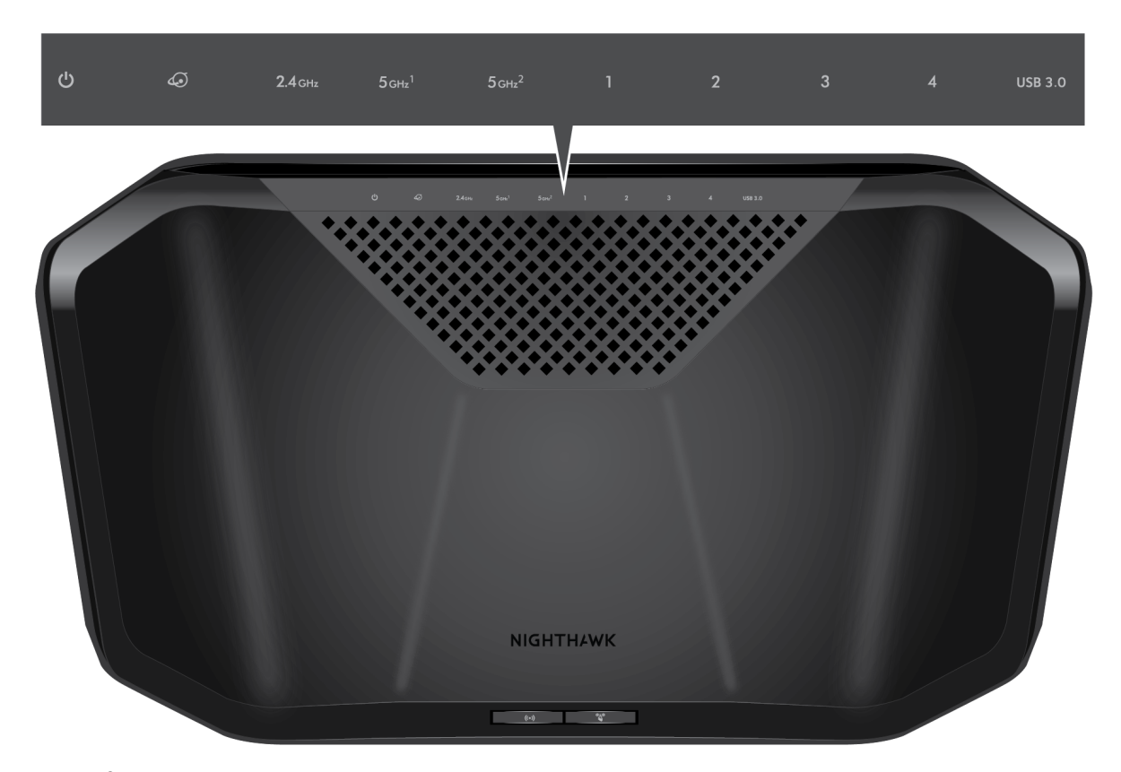
Figure 2. Top view

The status LEDs and two buttons are located on the top panel of the router.