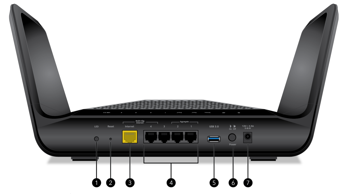
Figure 3. Rear panel

The following figure shows the rear panel connectors and buttons.